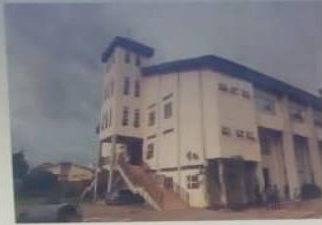
Cathedral of Grace Diocese of Kubwa