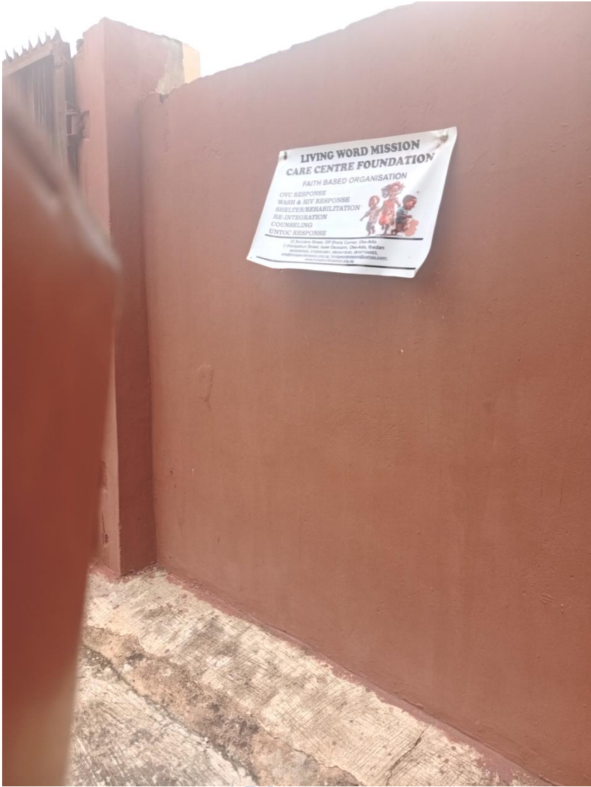
Another Orphanage Home: Living Word Mission Care Centre Foundation