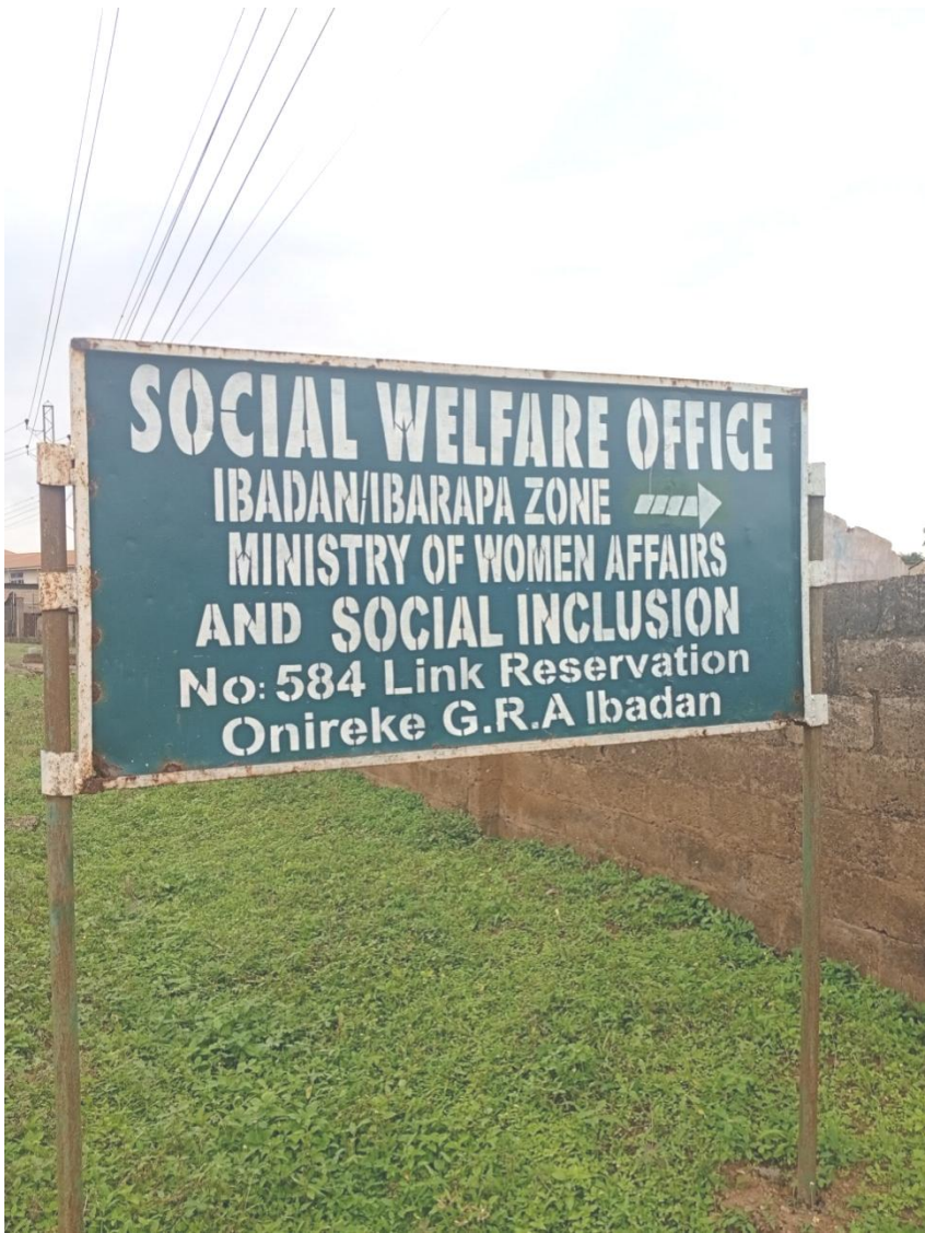
Social Welfare Office at Onireke, Ibadan