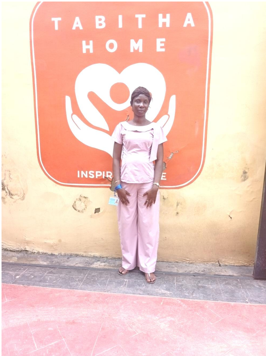
The Researcher in Front of One of the Orphanage Homes