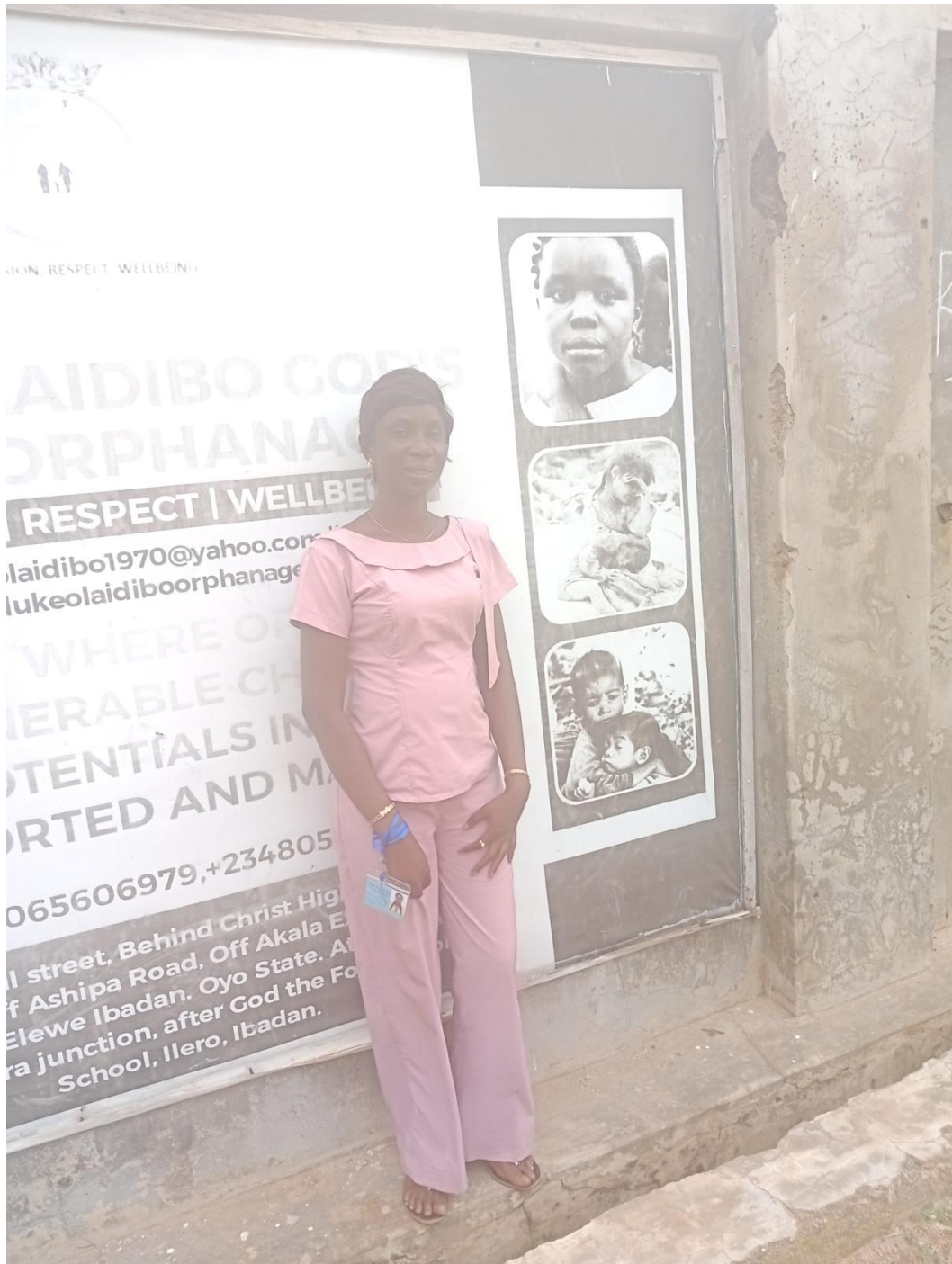
The Researcher at AdukeOlaidibo Orphanage Home