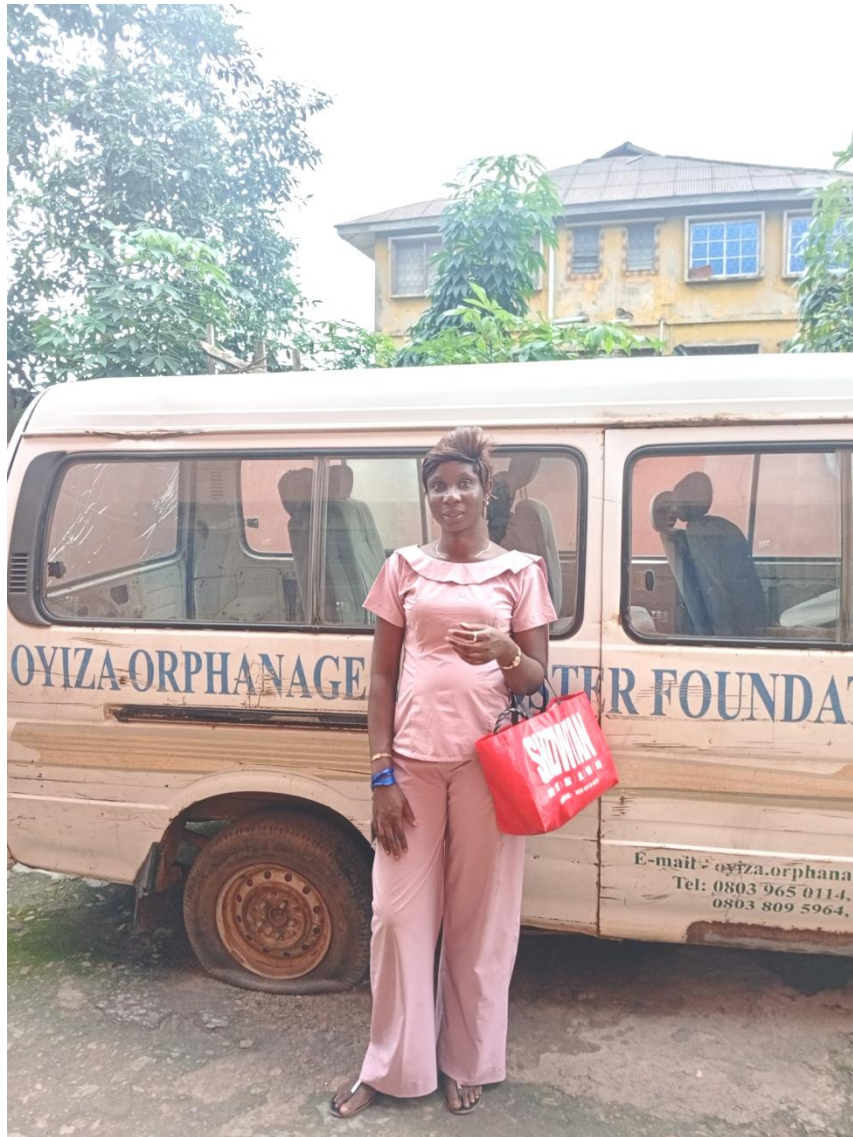
The Researcher at Oyiza Home of Love