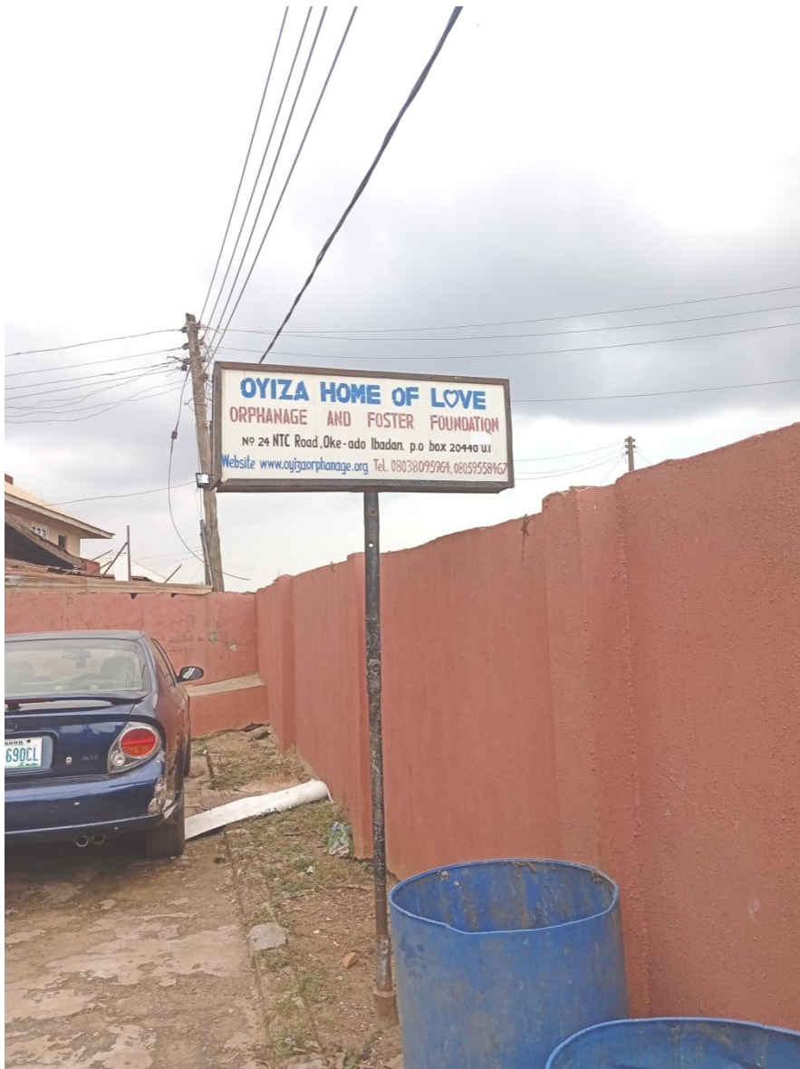
An Orphanage Home in Oke Ado, Ibadan: Oyiza Home of Love